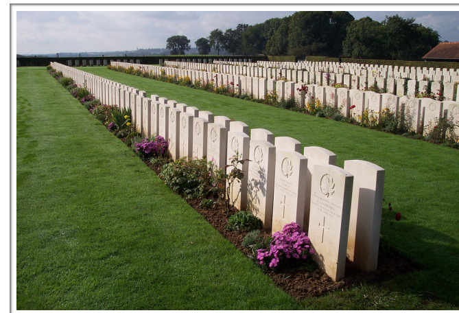
Dieppe Canadian War Cemetery